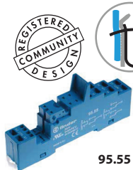
95.55 See page 15