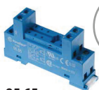
95.65 See page 18