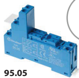
95.05 See page 14